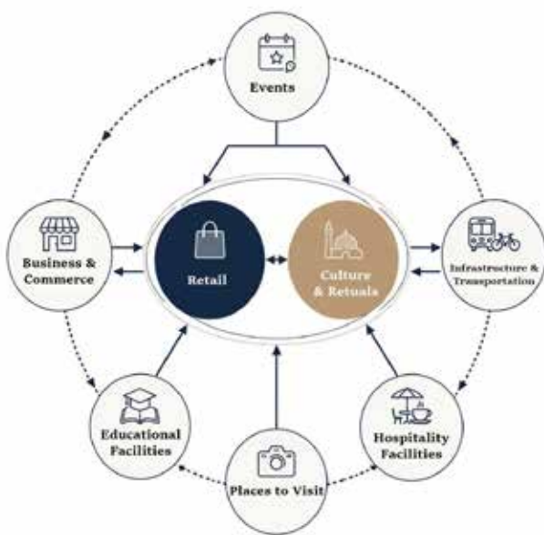
Fig. 4. Conceptual model of the interaction of urban tourism indicators influencing the regeneration of historical alleys from the perspective of tourists.