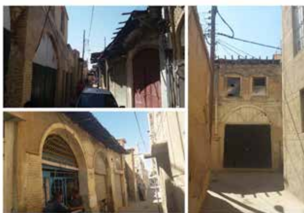
Fig. 3. Spaces of Haj Zeynal Bazaar and the historic building of Haj Bagher Mosque Tekyeh in Kooy e Afshar passage.

planning (Kadivar & Saqae, 2006). Moreover, tourism development will be successful and sustainable only when all social groups, particularly those who have historically had limited roles and influence in society, are included in decision-making processes, tourism planning, and the distribution of its benefits. These groups include women, youth, the elderly, and ethnic and religious minorities (Hajian, 2013). Therefore, given that the primary impacts of urban tourism affect both destination residents and visiting tourists, and considering that civic participation constitutes a fundamental pillar of sustainable development, this section seeks to identify and prioritize the significance and degree of influence of tourism indicators from the perspective of visitors to the historic passages of Shiraz's old urban fabric.