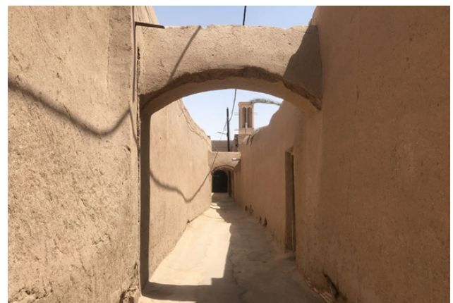
Fig. 3. Uniformity and simplicity of the alley walls in the historical fabric of Yazd.

The presence of green spaces and plants in the central courtyards of historical homes in Yazd is very important. However, these elements usually have a less prominent presence in the alley. In fact, the presence of plants in the alley generally manifests as branches of trees that, by extending over the mud-brick and clay walls of adjacent houses, expose themselves to passersby and individuals present. These trees, through their shading and unique beauty, contribute a distinctive quality and sense of liveliness to the alley space (Naghizadeh et al., 2012). Moreover, trees play a crucial role in regulating environmental conditions in hot and dry climates, providing climatic comfort. They effectively reduce direct sunlight exposure and its reflection in the alley, mitigating the reflection of sunlight from the ground and walls, thus moderating temperatures. Additionally, trees