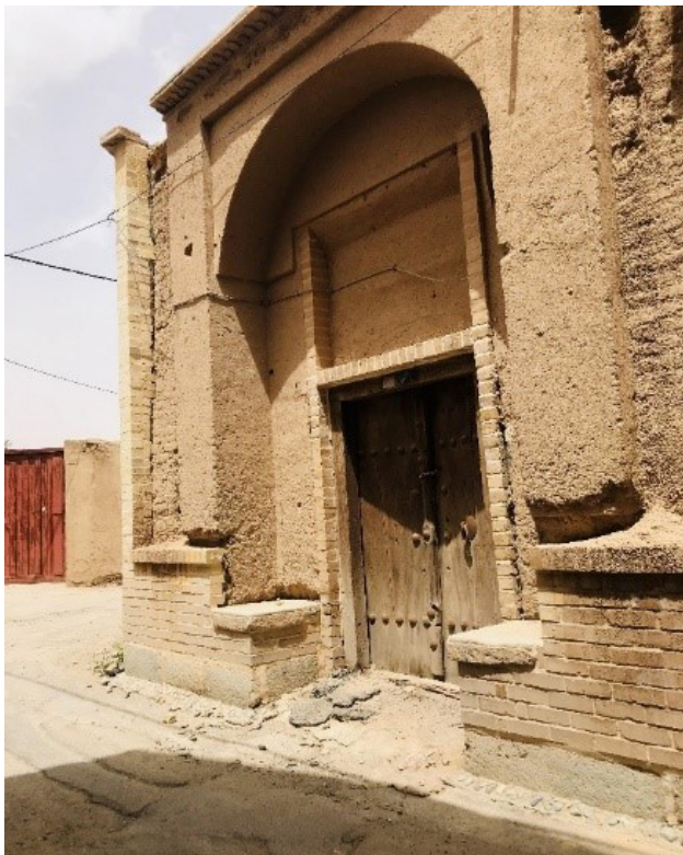
Fig. 4. Pirneshin as urban furniture and enhancing presence.

and plants significantly help reduce dust and wind in the alley while increasing ambient humidity (Afshari Basir et al., 2017). On the other hand, the presence of trees and plants in the alley also conveys cultural symbolic meanings. The foliage of trees and plants in the alley symbolizes the generosity and hospitality of the residents toward the alley, neighbors, and passersby, extending the beauty found within private spaces to the public realm to be shared with others. This fosters social bonds among neighbors and community members, strengthening the sense of place. Furthermore, the hanging branches and leaves may signify an appreciation for nature and reflect a sense of naturalism among the alley's residents, conveying meanings of blessing, growth, and continuity in Iranian culture (Fig. 5).