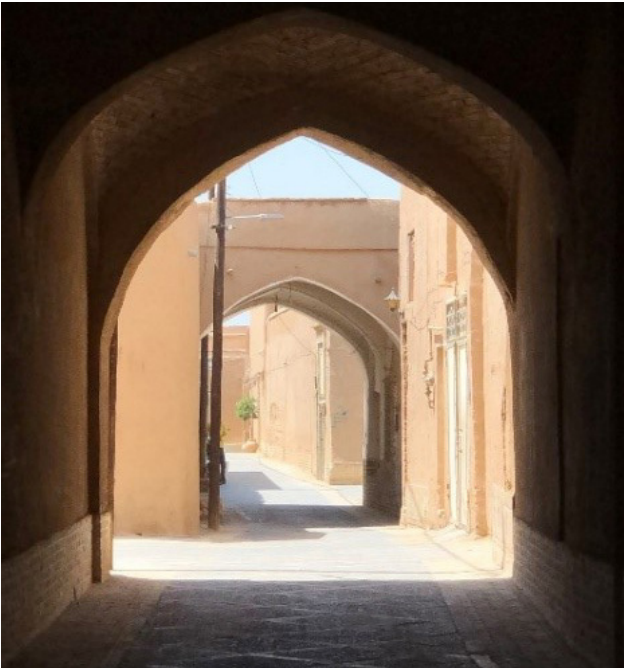
Fig. 2. The play of light and shadow created by the sabat in the historical fabric of Yazd, enhancing urban readability.

height of adjacent buildings and their floors. However, in many cases, walls are considerably tall, and due to the narrow width of pathways, they contribute to climatic comfort by shading and moderating heat during hot seasons. Visually, this enclosure creates a narrow and intimate space, offering a degree of privacy and security that encourages pedestrians to walk through and explore (Shabani & Mansouri, 2021). Beyond their functional role, walls reflect the cultural values and beliefs of the residents. In Yazd's historic alleys, monochrome walls contribute to the distinctive character of neighborhoods, making them appear as a cohesive, singular mass—as if they have been shaped from a unified material. These walls are typically made of mudbrick and plaster, presenting a simple, uniform aesthetic. Unlike modern urban facades, they are neither diverse nor visually loud, aligning with the introverted architectural principles embedded in Yazdi culture. As a result, the private lives of residents remain hidden, with no external expression or reflection on the alley's walls (Sartipi Isfahani, 2023) (Fig. 3).