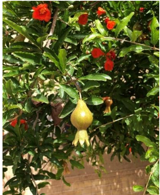
Fig. 5. The presence of branches and leaves of trees and plants in the alley, creating a connection between inside and outside in the historical fabric of Yazd. Photo: Saba Mirzahosein, 2023.

Functionally, they help mitigate and control the harsh climatic conditions of Yazd and also contribute aesthetic value to the alley's landscape. In Iranian culture, trees and plants are considered elements with strong symbolic meanings; thus, they can be linked to concepts such as generosity, the residents' hospitality toward the alley, continuity between inside and outside, naturalism, growth, and blessings (Table 1).