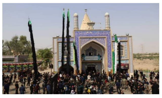
Fig. 1. Alam Gerdani in Khuzestan. Source: https://iqna.ir/files/fa/news.

Dehkhoda (2007) defines Nakh as follows: "It is like a tree that is made of wood and decorated with all kinds of colorful silk scarves, precious fabrics, mirrors, lamps, etc., and decorated with flowers and greenery. On the day of Ashura, they take it to the place where the