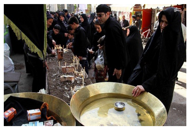
Fig. 6. Sham paylamakh and Blessed Water.