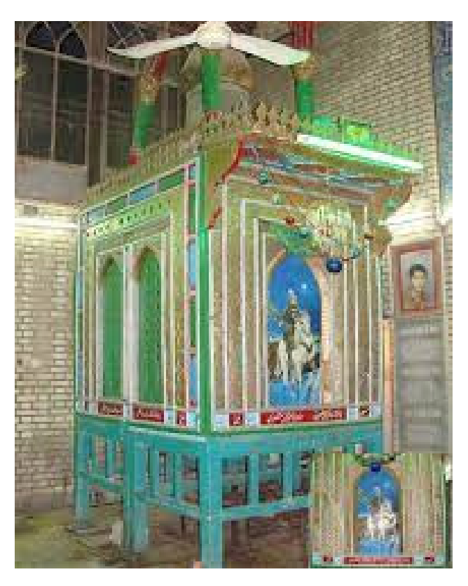
Fig. 3. Sheydouneh.

valley), Ababafan Mosque and old neighborhoods such as Pir Nazar neighborhood and Kornasian<sup>3</sup>" (Fig. 3).