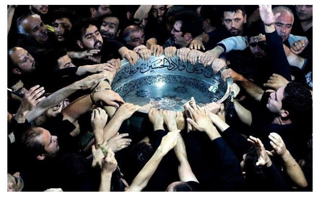
Fig. 4. Tasht Gozari Ceremony.