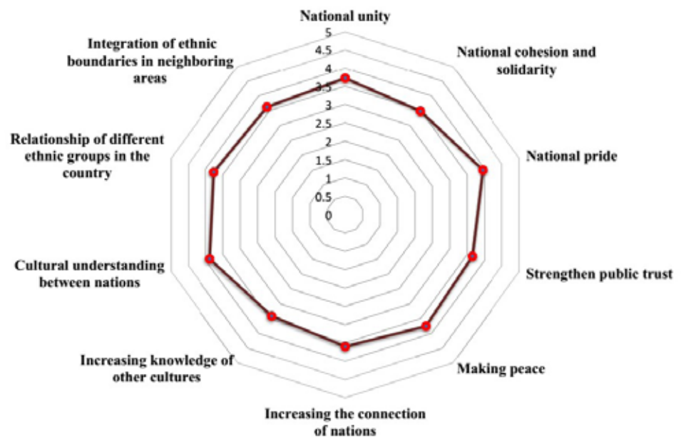
Fig. 3. Cultural impact of tourism at the national level.

are consistent with the findings of Vazin et al. (2018) that found tourism development has promoted the cultural awareness of local people.